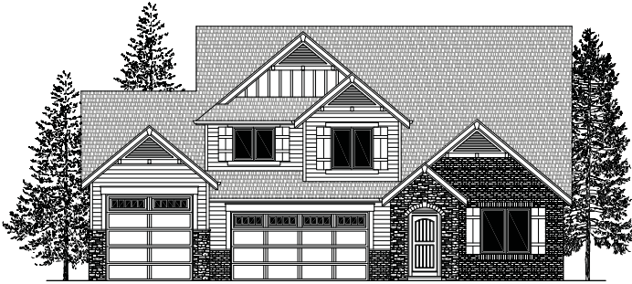
THE MAKENZIE "P"